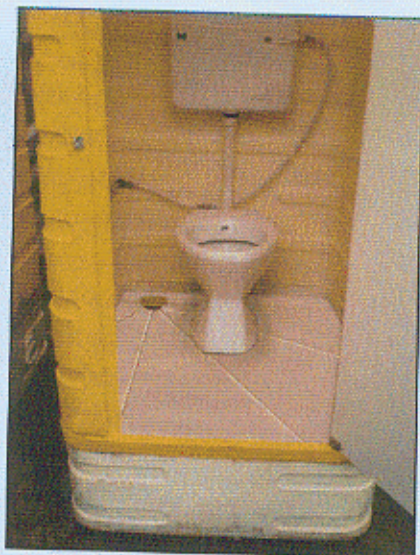
Western type WC block RMTB-EWC-90100