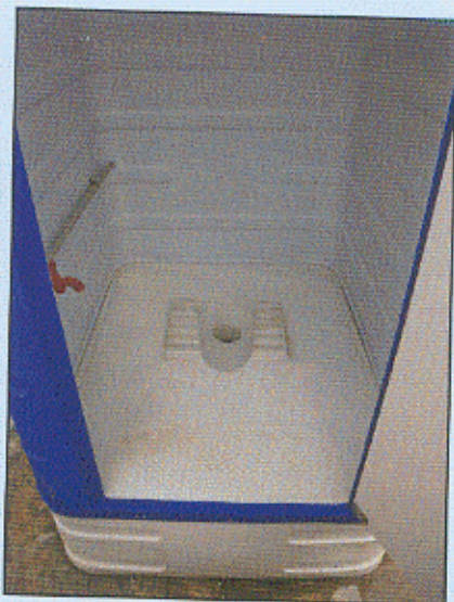
Indian type WC block RMTB-IWC-90100